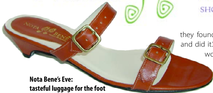
Nota Bene's Eve: tasteful luggage for the foot

launched her fashion comfort collection, engineered and built in Spain, in 2004. Now Nota Bene's first domestic-built shoes are rolling off the line for delivery.