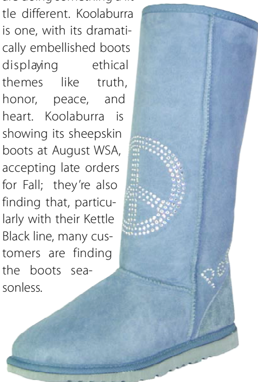
Koolaburra's Peace Rocks (especially when embellished with Swarovski crystals), $425

It's a treat to find manufacturers who are doing something a little different. Koolaburra is one, with its dramatically embellished boots displaying ethical themes like truth, honor, peace, and heart. Koolaburra is showing its sheepskin boots at August WSA, accepting late orders for Fall; they're also finding that, particularly with their Kettle Black line, many customers are finding the boots seasonless.