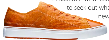
PF Flyer Albin, in orange wrinkled Italian leather with patent toe cap, $110

PR/marketing rep Kristina Helb says "the brand has found out what its niche is and what it does best. We use texture as much as color to appeal to the young trendsetter who wants to seek out what's new in