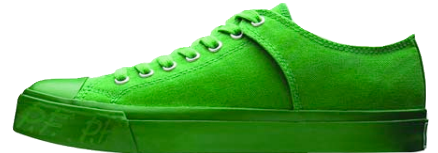
PF Flyer All American Lo Top Reissue, circa 1956 with 2008 colors: natural, black, green or navy canvas, $60