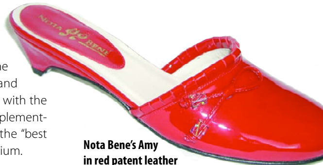
Nota Bene's Amy in red patent leather