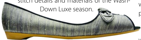
Ariel: PF Flyer's elegant skimmer

PF Flyers has six new styles for the Spring 2008 season, themed "Wash-Down Luxe." Three of the new styles are women-specific, two are unisex, one men's. Key among them are the women's Ariel, an elegant peep-toe skimmer available in Indian shantung or floral print canvas. The men's Albin (shown), is an "evolved" classic sneaker on a modern last. The spring collection includes a unisex model, Crosskort, which is a return of the "mid-century tennis classic," with vintage PF logos and updated with unique stitch details and materials of the Wash-Down Luxe season.