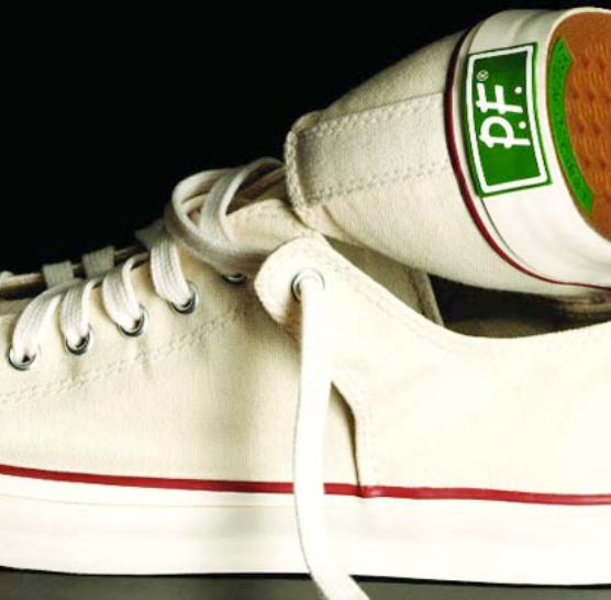
PF Flyers of the '50s: all-American staples

the sneaker market. The customer is fashion-savvy and metropolitan, but also looking for chic comfort."