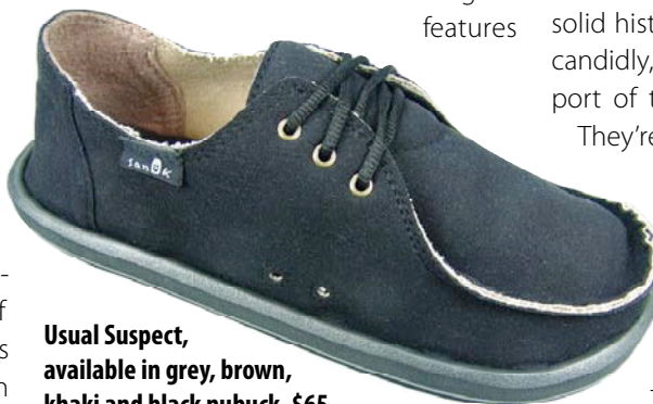
Usual Suspect, available in grey, brown, khaki and black nubuck, $65

While all other athletic-oriented shoe manufacturers are boasting a multitude of technological features