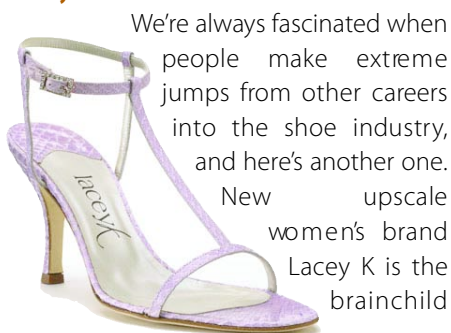
Lacey K New York in lilac-glazed python, $310