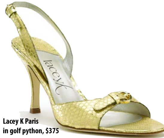
Lacey K Paris in gold python, $375