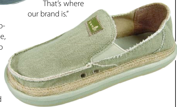
Hey Jute in moss, also available in khaki, $55