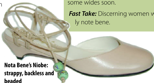
Nota Bene's Niobe: strappy, backless and beaded

they found us, and I went ahead and did it." She adds, "We know it works"—the evidence is ecstatic repeat customers and positive feedback