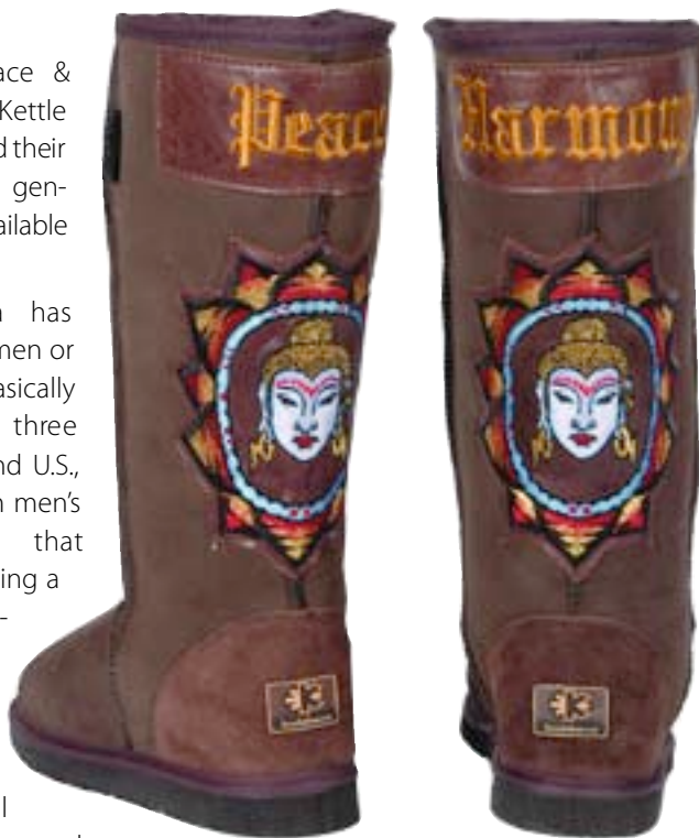
Peace & Harmony from Koolaburra's Kettle Black Collection, $400